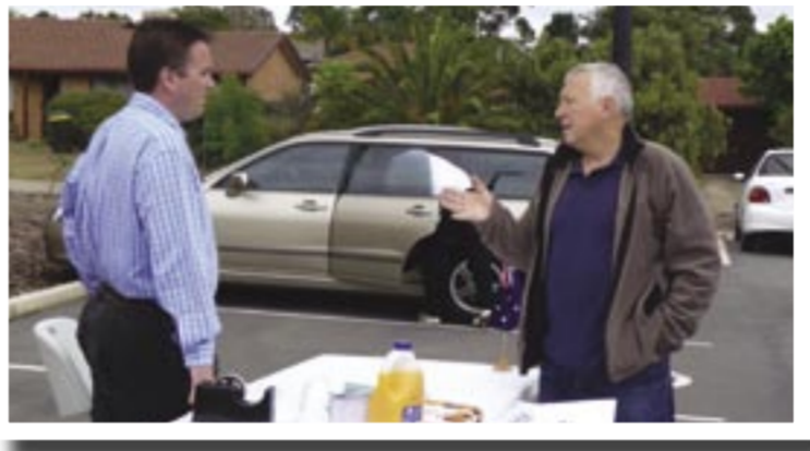
Mobile office in Aberfoyle Park