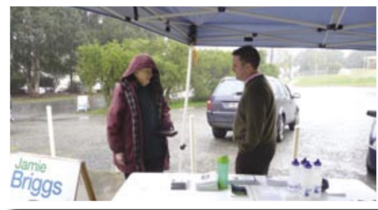
Mobile office in Mount Compass