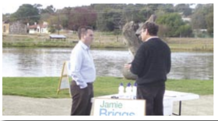
Mobile office in Nairne

I have read every survey and the exercise was overwhelmingly positive. I appreciate very much each person who took the time to fill out and return the survey.